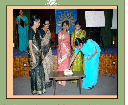
The August born celebrating their Birthda v